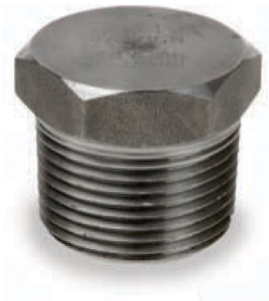
Fig. 42HP3 – Hex Head Plug